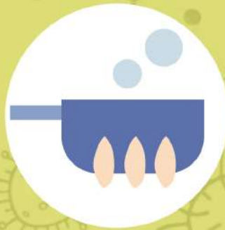
Cook Food Thoroughly