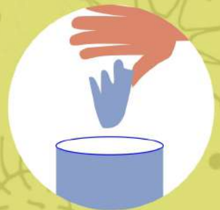
Throw tissue in Bin after use