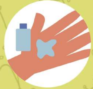
Use Hand Sanitizer