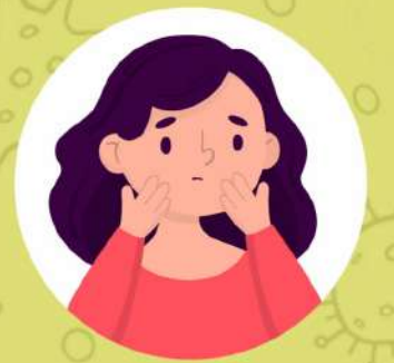
Avoid Touching Face