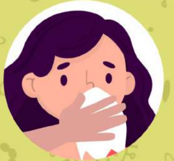
Cover Mouth when Sneezing or Coughing