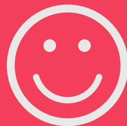
New Joinees for the month of JAN 19 AND FEB 19 in Krishi and Sankalp